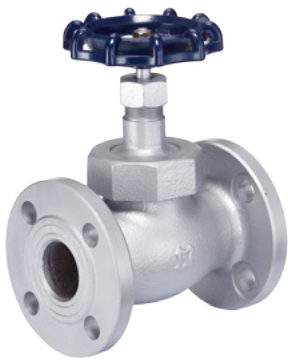
FIG.FK39D JIS 20K