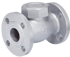
FIG.FK69D JIS 20K