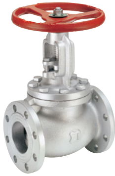
FIG.F39D-BB JIS 10K/KGMC 16K