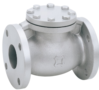
FIG.F69D-BC JIS 10K/KGMC 16K